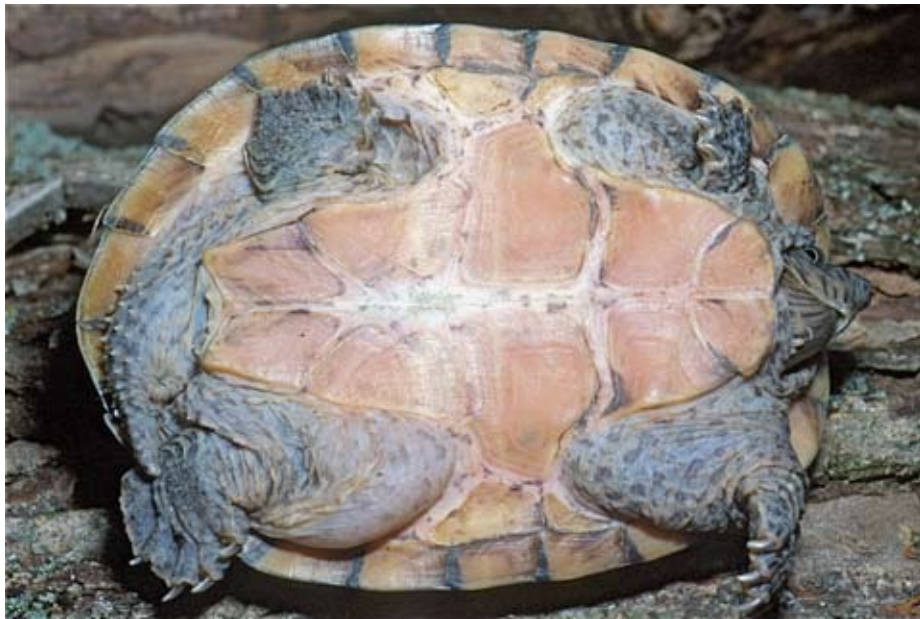
Figure 2. Adult Sternotherus carinatus from Louisiana.

species being sister to the remaining congener, S. odoratus . Iverson (1991) followed Seidel et al. (1986) in placing Sternotherus in synonymy with Kinosternon , using Kinosternon carinatum for the razorback musk turtle. The change was suggested due to a lack of recognized synapomorphies for the members of Sternotherus , but Iverson (1998) later reversed his decision based on phylogenetic analysis of a larger data set and has used the name Sternotherus carinatus in more recent publications (e.g., Iverson 2002).