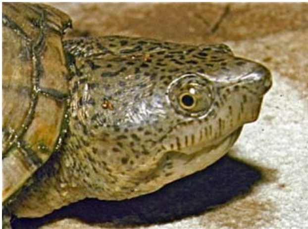
Figure 3. Adult Sternotherus carinatus from Arkansas.

2) presence of a pair of barbels on the chin but not on the neck; 3) presence of distinct small dark spots and absence of striping on the light brown to pink head and limbs; and 4) (usually) lack of a gular scute, leaving 10 plastral scutes rather than 11. The skull of S. carinatus is distinct from those of its two closest relatives, S. minor and S. depressus , based on a more pointed supraoccipital, presence of a prominent