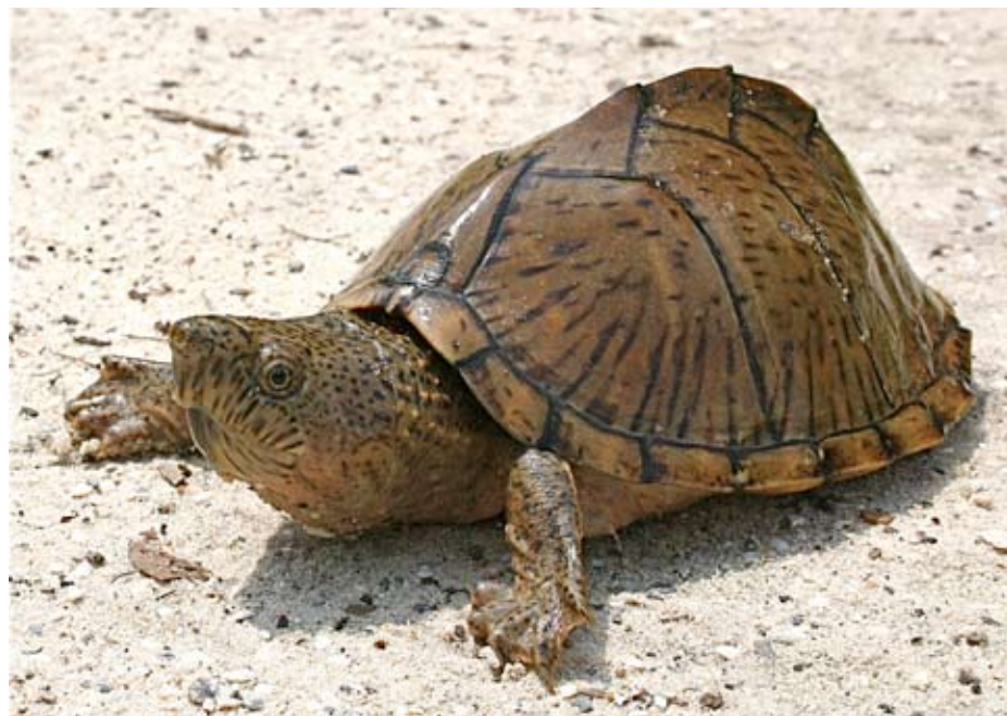
Figure 1. Adult Sternotherus carinatus on a beach on the Pascagoula River, Mississippi.

designated for S. carinatus , nor have geographic trends in morphology or genetic variation been analyzed. Iverson’s (1991, 1998) total-evidence analyses of morphological and molecular data sets found S. carinatus to be sister taxon to a S. minor plus S. depressus clade, with this clade of three