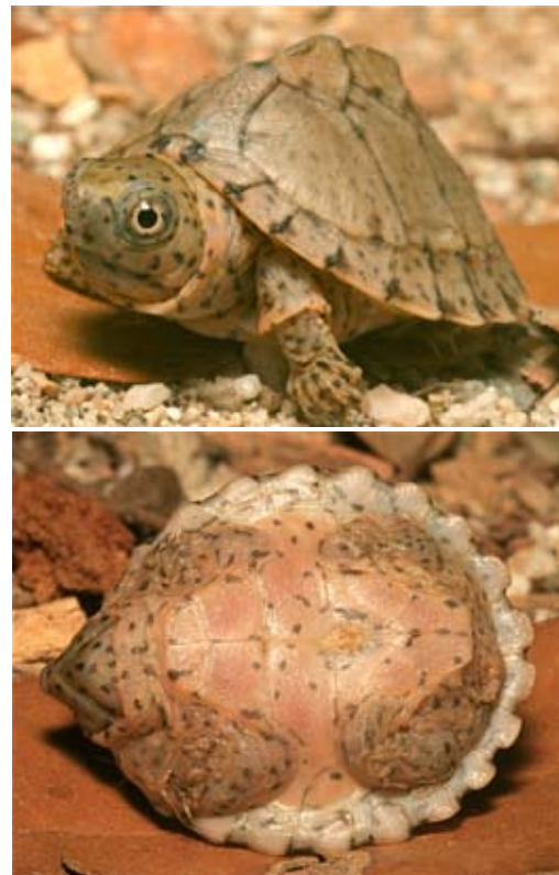
Figure 4. Hatchling Sternotherus carinatus from McCurtain County, Oklahoma.