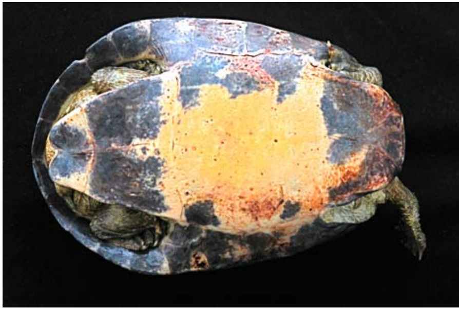
Figure 2. Hardella thurjii ; adult female. Shella, Cherrapunji, Meghalaya, India.

Lesson 1831, Kachuga oldhami Gray 1869, Batagur floweri Lydekker 1885, Batagur cautleyi Lydekker 1885, and Batagur watsonii Lydekker 1886.