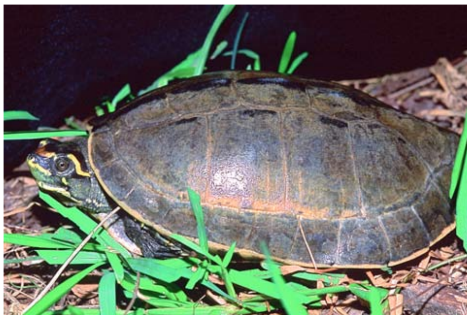
Figure 1. Hardella thurjii ; adult male. National Chambal Sanctuary, Madhya Pradesh, India.

(1885, 1886) placed the species in the genus Batagur , in his monographs on the fossil turtles of India. All authors have, however, continued to recognize Hardella as a distinct genus for this species. Synonyms include Emys flavonigra