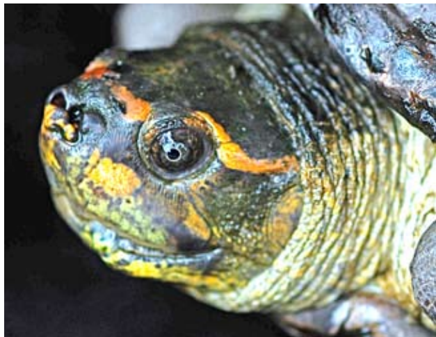
Figure 3. Hardella thurjii ; adult female portrait. Shella, Cherrapunji, Meghalaya, India.