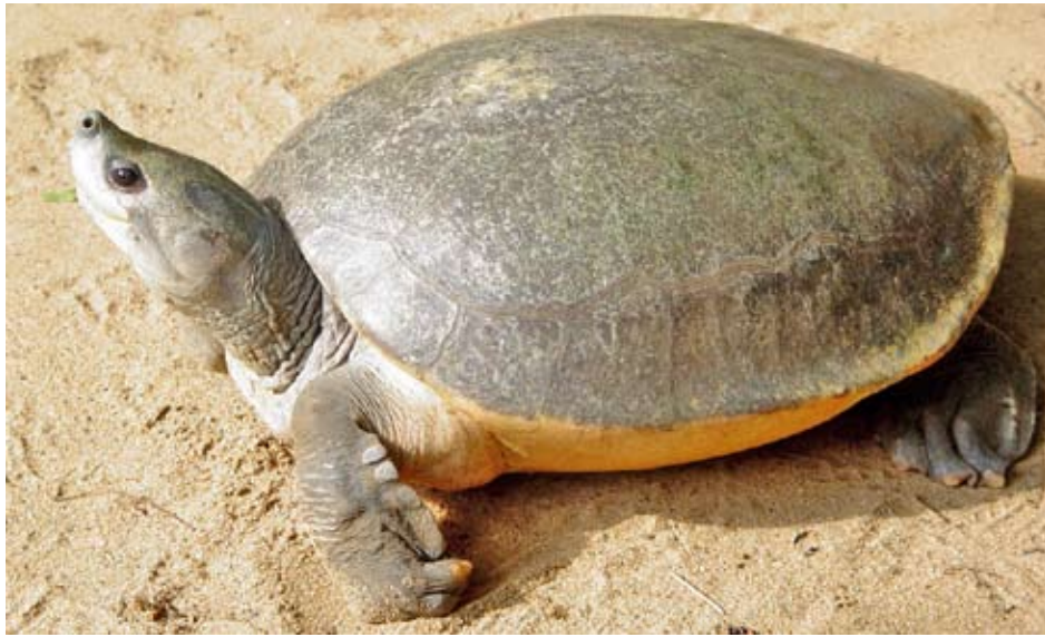
Figure 1. Captive female Batagur baska from the Madras Crocodile Bank believed to be from the Indian Sundarbans.

The genus name Tetraonyx (“four claws” in contrast with the trionychids or “three claws”) subsequently gained wide acceptance as the genus. Combinations using that genus included T. longicollis Lesson (1831), T. lessonii Duméril and Bibron (1835), and T. affinis Cantor (1847), the latter now considered a separate species. Tetraonyx proved to be a junior homonym of a coleopteran and had to be replaced. The spelling variant Tetronyx Lesson 1832, is considered a nomen novum (a replacement name) (Bour 2009), but has rarely been used, and is now a nomen oblitum . Temminck and Schlegel (1835) used the epithet tetraonyx as a replacement species name for Tetronyx longicollis Lesson, and placed it in Emys . The combination Batagur baska was first used by Gray (1856). The convoluted history of names used for Batagur baska was reviewed by Bour (2009), who included illustrations of the types of Tetraonyx longicollis Lesson 1831 and Tetraonyx lessonii Duméril and Bibron 1835.