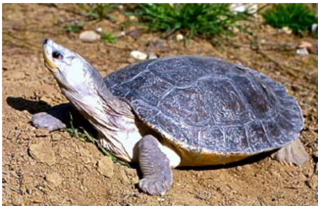
Figure 5. Light-colored female Batagur baska from the Indian Sundarbans.

In profile, the head appears relatively small with an attenuated, upturned snout. The jaws are serrate, with the upper bicuspid (a median notch flanked by pointed tooth-like projections) and the lower with a complimentary medial tooth flanked by a shallow notch on each side. The feet are fully webbed with only the tips of the claws extending beyond the webbing. The forelimbs bear a series of transversely elongated band-like scales. A flap of skin, reinforced by enlarged scales, borders the forelimb laterally and merges with the webbing of the toes, giving the limb a paddle-like appearance. Scallation on the hind limb is reduced, but a lateral flap of skin and associated scales are present. The posterior and lateral aspect of the hind-foot is decked with a series of small transversely elongated scales.