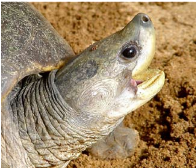
Figure 2. Close up of the above female Batagur baska , showing denticulate jaw and ridges.

The genus name Tetraonyx (“four claws” in contrast with the trionychids or “three claws”) subsequently gained wide acceptance as the genus. Combinations using that genus included T. longicollis Lesson (1831), T. lessonii Duméril and Bibron (1835), and T. affinis Cantor (1847), the latter now considered a separate species. Tetraonyx proved to be a junior homonym of a coleopteran and had to be replaced. The spelling variant Tetronyx Lesson 1832, is considered a nomen novum (a replacement name) (Bour 2009), but has rarely been used, and is now a nomen oblitum . Temminck and Schlegel (1835) used the epithet tetraonyx as a replacement species name for Tetronyx longicollis Lesson, and placed it in Emys . The combination Batagur baska was first used by Gray (1856). The convoluted history of names used for Batagur baska was reviewed by Bour (2009), who included illustrations of the types of Tetraonyx longicollis Lesson 1831 and Tetraonyx lessonii Duméril and Bibron 1835.