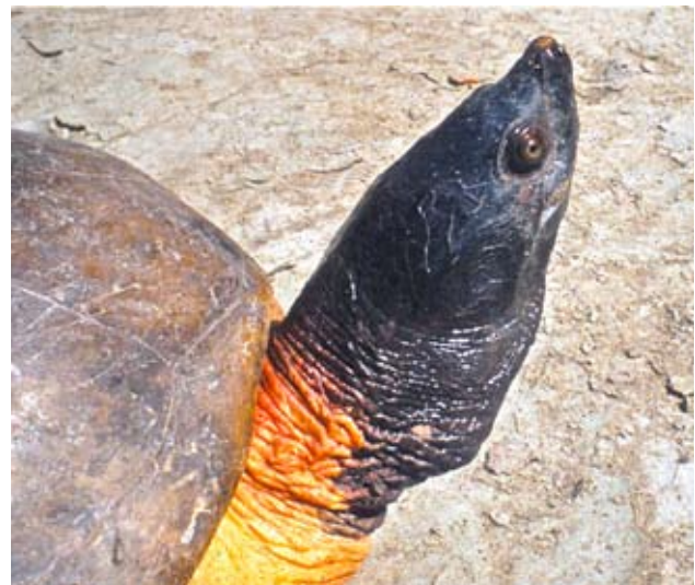
Figure 3. Male Batagur baska in breeding coloration from the Bangladesh Sundarbans.

Praschag et al. (2007), using DNA sequences of the mitochondrial cytochrome b gene, examined the relationships of species then constituting the genera Batagur , Callagur , Kachuga , Pangshura , and Hardella . A key finding was that