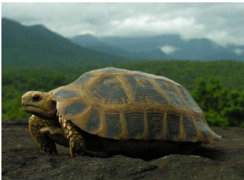
Figure 1. Female Indotestudo travancorica from the Anamalai hills, southern Western Ghats, India.

India. Boulenger noted that it bore resemblance to both Testudo elongata , from the northern and eastern parts of the Indian subcontinent, and T. forsteni [sic] from Celebes (now Sulawesi, Indonesia) and the neighboring Gilolo Is-