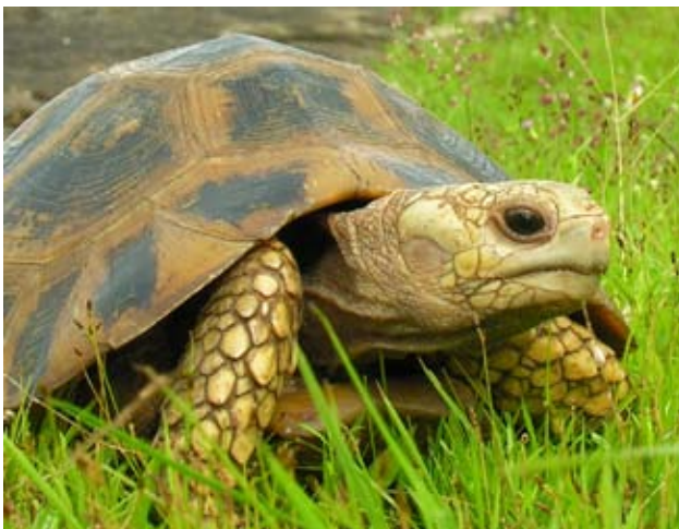
Figure 3. Close-up of the head of an adult male Indotestudo travancorica.