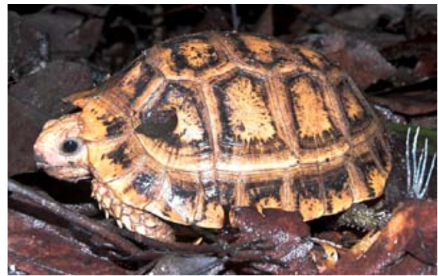
Figure 4. Yearling of Indotestudo travancorica from the Anamalai hills, Western Ghats.

A sexually dimorphic species, the abdominal region of the plastron is concave in males and flat in females, while the tail claw is longer and hooked in males, and small and conical in females (Auffenberg 1964b; Vijaya 1983; Das