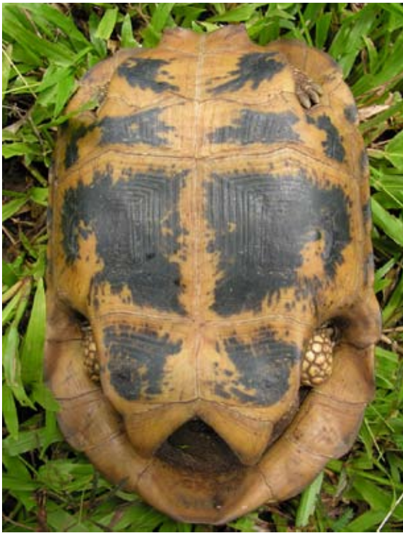
Figure 2. Ventral view of an adult female Indotestudo travancorica.