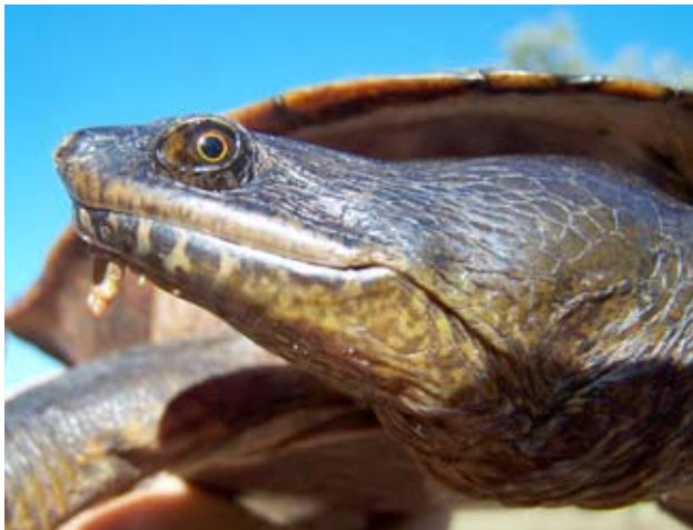
Figure 4. Head of Chelodina burrungandjii showing the stippling on the lower jaw (not diagnostic) and the prominent barbels found on many specimens. In some, the barbels form a series running along the lower surface of the lower jaw; this specimen has three pairs.