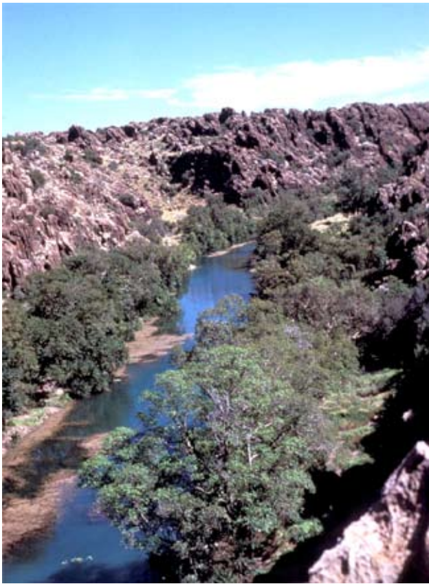
Figure 5. Chelodina burrungandjii occupies permanent billabongs and plunge pools of the sandstone plateau and associated escarpment of Arnhem Land (Northern Territory) and the Kimberley Region (Western Australia). Shown here is the Mann River, Northern Territory, where the species was first discovered by scientists.

The dorsal to mid-lateral surface of the head is covered with smooth, soft skin broken into numerous irregular uncornified scales of negligible relief, dark olive green to black in color, sometimes with fine black specks (Fig. 4). Eyes are chocolate brown with a gold, occasionally orange, ring bordering the pupil. Upper rhamphotheca are olive with light black flecks. Lower rhamphotheca are olive with numerous black/brown striations. Tympanum is light olive with dark mottling. Barbels are variable in number, typically two are prominent, but up to four run in a line along the inside edge of each lower jaw (Fig. 4).