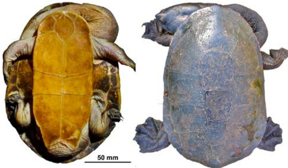
Figure 2. Dorsal and ventral view of the shell of Chelodina burrungandjii – females from the Kimberley of Western Australia. Note the proximity of the intergular to the margin of the plastron, which barely separates the gulars.