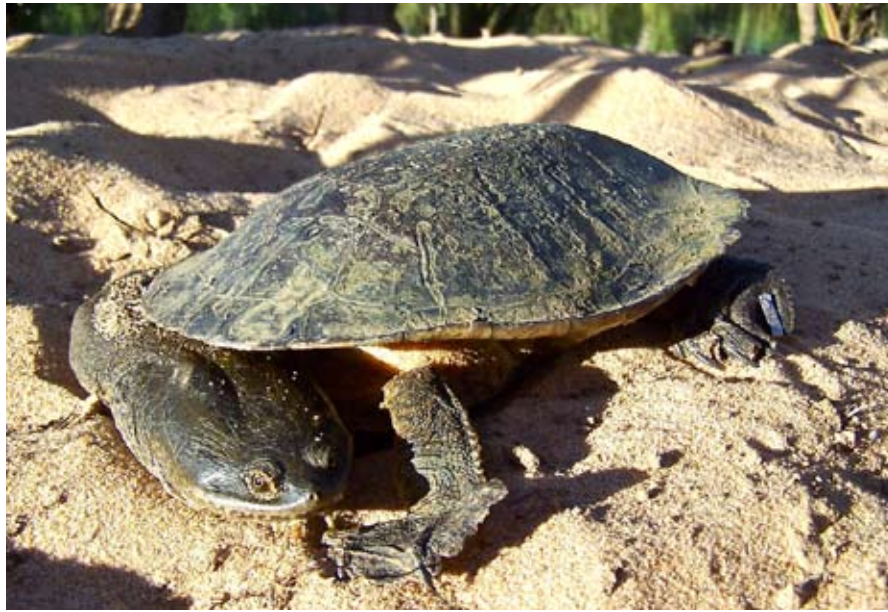
Figure 1. A female Chelodina burrungandjii from the Kimberley Region of Western Australia. Note the extremely broad, flattened head that distinguishes the species from C. rugosa .

Similar specimens from the Kimberley region in northern Western Australia were subsequently described as a new species, Macrochelodina walloyarrina , by McCord and Joseph-Ouni (2007). Based on our analysis, the Arnhem Land and Kimberley forms are synonymous and identifiable as C. burrungandjii . Although some morphological characters distinguish the two (Thomson et al. 2000), the significance of such differences is difficult to interpret in allopatry, and the discovery of widespread introgression with C. rugosa (Alacs 2008) could potentially have caused morphological shifts in Arnhem Land that are not related to the normal processes of divergence of allopatric forms. We therefore consider separate specific or subspecific designation of the Kimberley form to be unwarranted at this stage, and include both the Kimberley and Arnhem