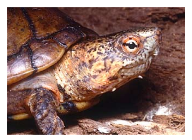
Figure 4. Adult female Kinosternon acutum from Belize.