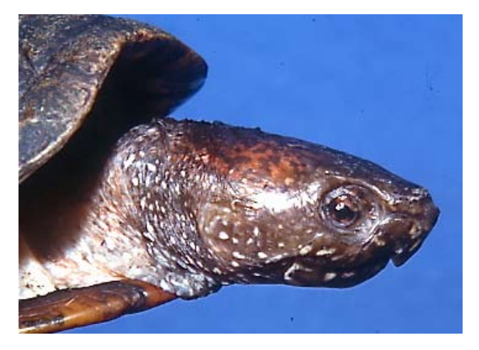
Figure 3. Adult male Kinosternon acutum from Belize.

Description . — This is one of the smallest kinosternid turtles, with males reaching only about 105 mm and females reaching about 120 mm in carapace length (CL) (100 and 115 mm maximum plastron length, respectively). The adult carapace is usually unicarinate, but a faint pair of lateral keels is sometimes evident in subadults. The first vertebral scute is in contact with the second marginal, and the fourth pleural scute usually touches the eleventh marginal. The tenth and eleventh marginals are elevated above the level of the preceding marginals. The maximum shell height is less than 45% of CL. The carapace is brown to black in color and has dark seams.