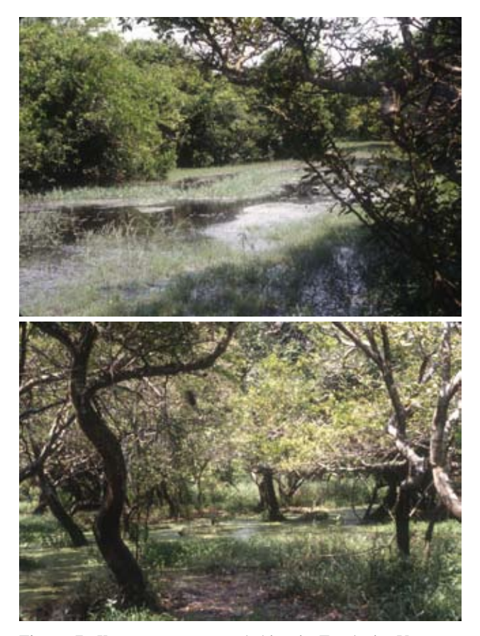
Figure 7. Kinosternon acutum habitat in Tecolapia, Veracruz, Mexico. Turtles forage in these shallow pools at night, and hide under leaf litter under trees and shrubs during the day.