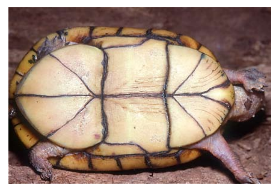
Figure 2. Adult female Kinosternon acutum from Belize.

for the species (1980), provided morphometric comparisons with its suspected sister taxon Kinosternon creaseri (1988), included it in a family-wide phylogenetic analysis (1991, 1998), and mapped its known distribution (1992). Pritchard (1979), Smith and Smith (1979), and Ernst and Barbour (1989) provided general reviews of this species.