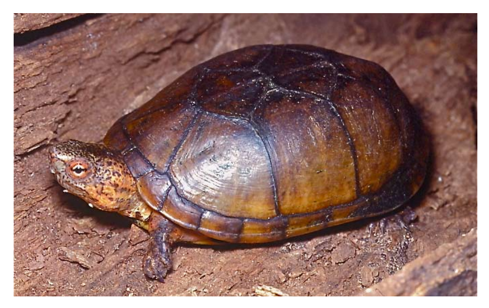
Figure 1. Adult female Kinosternon acutum from Belize.

syntypes from "Tabasco", Mexico; as Swanka maculata by Gray (1869) based on a composite of specimens of K.acutum and K. leucostomum from Mexico and Guatemala; and as Cinosternon effeldtii by Peters (1873) based on a specimen from Veracruz, Mexico. However, it has correctly been known as Kinosternon acutum since the first use of that combination by Stejneger in 1941. Iverson reviewed the literature