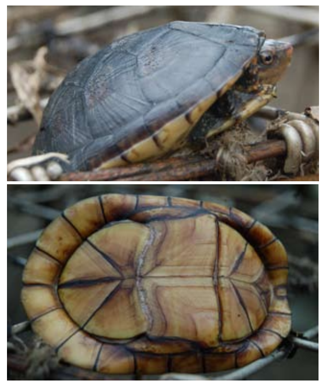
Figure 6. Juvenile Kinosternon acutum in its 3rd year of growth, basking on a rustic turtle trap in La Florida, Municipio Angel de Cabada, Veracruz, Mexico.

The double-hinged plastron is not emarginate posteriorly. The gular scute length exceeds 50% of the plastral forelobe length. The interabdominal seam length is more than 27% of the maximum plastral length and more than 80% of the plastral forelobe length. The forelobe length is 27-33% of