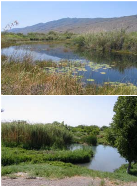
Figure 5. Habitat of Apalone spinifera atra in Cuatrociénegas Basin. Top: Poza del Tío Cándido, type locality. Bottom: Anteojo.

Apalone spinifera atra is listed as Critically Endangered by the IUCN Red List (as Apalone atra ), Endangered by the US ESA, on CITES Appendix I, and a Species of Special