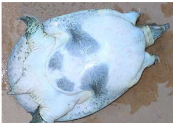
Figure 2. Apalone spinifera atra from Tío Cándido, Cuatrociénegas Basin, Coahuila, Mexico.

Description. — The black spiny softshell is a medium-sized aquatic turtle reaching 282 mm in carapace length. The ovoid carapace is low with fine longitudinal corrugations along the posterior border (often ragged or notched) and