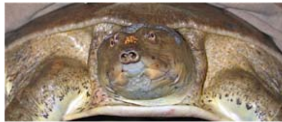
Figure 3. Apalone spinifera atra from Tío Cándido, Cuatrociénegas Basin, Coahuila, Mexico.