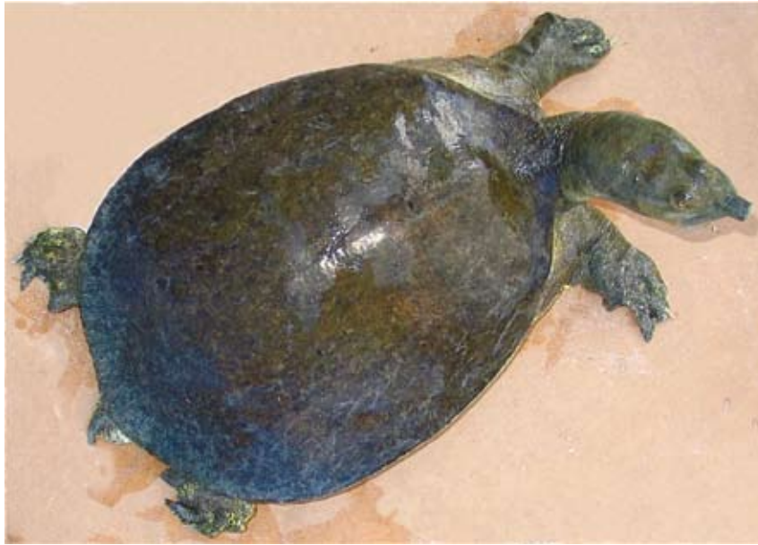
Figure 1. Apalone spinifera atra from Tío Cándido, Cuatrociénegas Basin, Coahuila, Mexico.

and Rio Cañon) which contained A. s. emoryi and A. s. atra intermediate morphs.