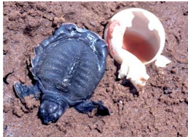
Figure 4. Hatchling Carettochelys insculpta from the Daly River, Northern Territory, Australia.