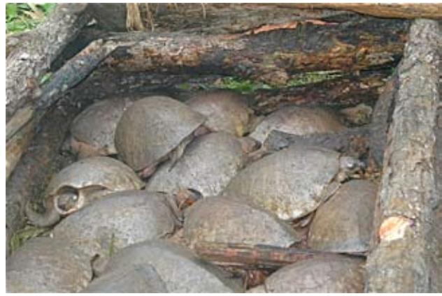
Figure 8. Stereotyped nesting habits render Carettochelys (like sea turtles) extremely susceptible to over-exploitation. Shown here are 24 adult nesting turtles harvested immediately after high tide on one night on one coastal beach in Papua New Guinea in 2007. The animals were flipped on their backs by the hunter who returned later to collect them and return them to camp where they were held in a makeshift enclosure until slaughter. The meat fed many families.

There are few data on levels of exploitation in Australia. Georges and Kennett (1988) reported an annual harvest of 19 turtles by two Aboriginal families at Nourlangie Camp, and the Wagiman Aboriginal people record their dry season harvest of turtles from the Daly River each year (Doody, pers. comm.) but without adequate data on population numbers and recruitment, it is not known whether this harvest activity exceeds a sustainable yield.