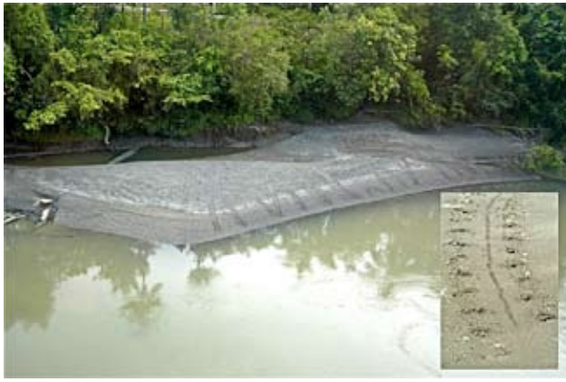
Figure 6. A typical riverine nesting beach for Carettochelys insculpta , Kikori River, Papua New Guinea. The distinctive tracks are clearly visible from helicopter.

billabongs and plunge pools of the Alligator Rivers region (Legler 1980, 1982; Press 1986; Georges and Kennett 1989). The preferred dry season habitat in the Alligator Rivers region is typified by Barramundi Creek (Legler 1982) and Pul Pul Billabong (Georges and Kennett 1989). Average depth was approximately 2 m but there were holes between 3 and 7 m deep. The substratum was sand and gravel covered with a thin layer of fine silt and litter. Fallen trees and branches, undercut banks, exposed tree roots, and local accumulations of litter provided a diverse range of underwater cover for turtles. The banks of the billabongs