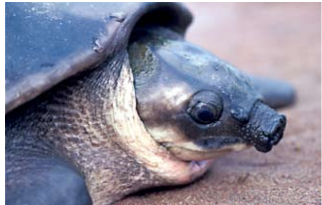
Figure 3. Adult female Carettochelys insculpta , Daly River, Northern Territory, Australia.