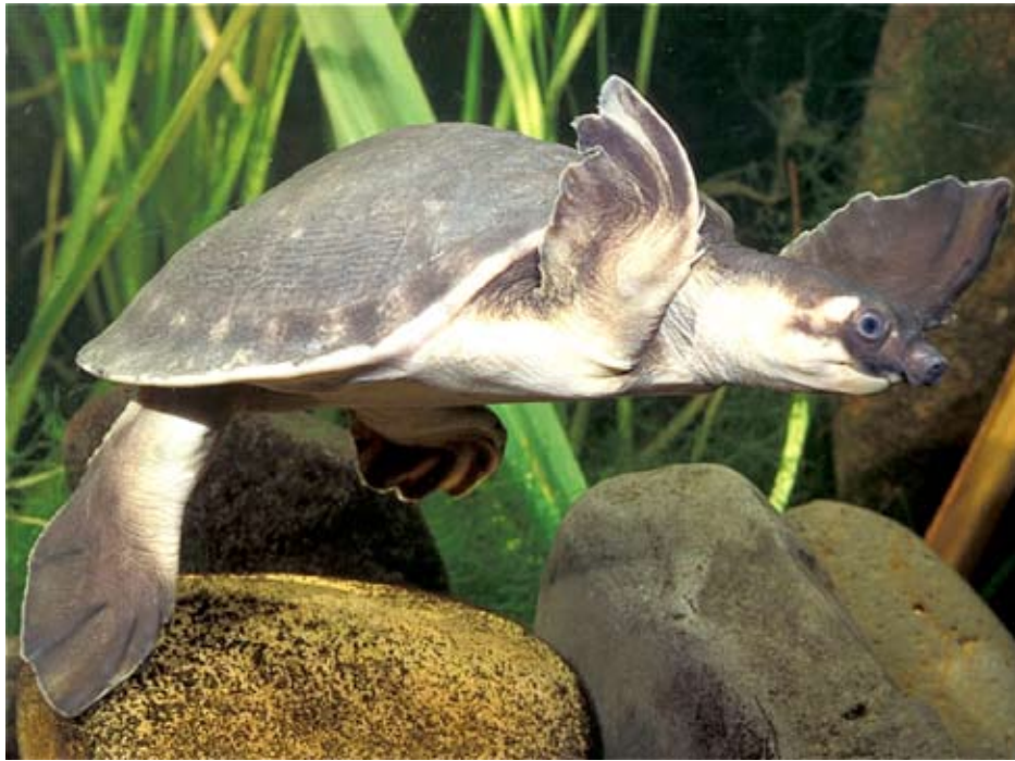
Figure 1. Subadult female Carettochelys insculpta , Daly River, Northern Territory, Australia.

included it among the suborder of side-necked turtles, the Pleurodira. He made this latter decision with some reference to morphological characters, but primarily because at the time, only side-necked turtles were known from Australia and New Guinea. Baur (1891a, b) was opposed to grouping Carettochelys with the side-necked turtles, and called upon Ramsay to release details of the articulation of the cervical vertebrae “to show at once the affinities of this peculiar genus.” Unfortunately, the specimen lacked key anatomical elements, the cervical vertebrae, so the matter remained one of considerable debate (Ogilby 1890; Strauch 1890; Vaillant 1894; Boulenger 1898; Gadow 1901; Hay 1908) until the work of Waite (1905) became widely known. He described a more complete specimen from the island of Kiwai at the mouth of the Fly River, and examination of the cervical vertebrae established that Carettochelys properly belongs in the suborder Cryptodira, not the side-necked Pleurodira.