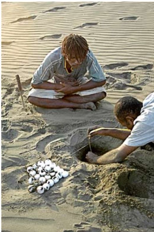
Figure 7. Carettochelys insculpta in Papua New Guinea nests on sand bars in the upper reaches of rivers, but also along the coast (as in this photo) where its nests are periodically inundated by the tides.

billabongs and plunge pools of the Alligator Rivers region (Legler 1980, 1982; Press 1986; Georges and Kennett 1989). The preferred dry season habitat in the Alligator Rivers region is typified by Barramundi Creek (Legler 1982) and Pul Pul Billabong (Georges and Kennett 1989). Average depth was approximately 2 m but there were holes between 3 and 7 m deep. The substratum was sand and gravel covered with a thin layer of fine silt and litter. Fallen trees and branches, undercut banks, exposed tree roots, and local accumulations of litter provided a diverse range of underwater cover for turtles. The banks of the billabongs