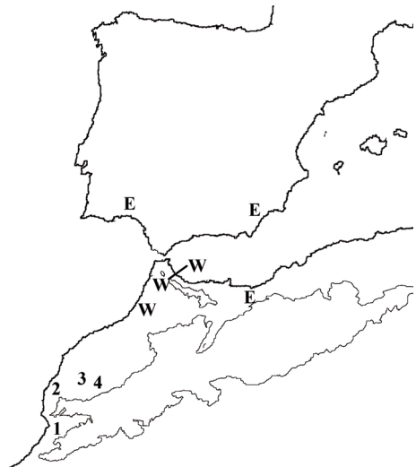
FIGURE 1. Sampling localities of Testudo graeca graeca in North Africa and the Iberian Peninsula. Sample sites of the eastern and western forms identified by ÁLVAREZ et al. (2000) are indicated by E and W respectively. Four southern populations new for this study are 1: Admine Forest, 2: Essaouira, 3: Central Jbilet Mountains, and 4: Tafarayate.

Specimens of T. graeca were captured from four populations in southern Morocco (Fig. 1). For this analysis four individuals per population were examined. A small piece of