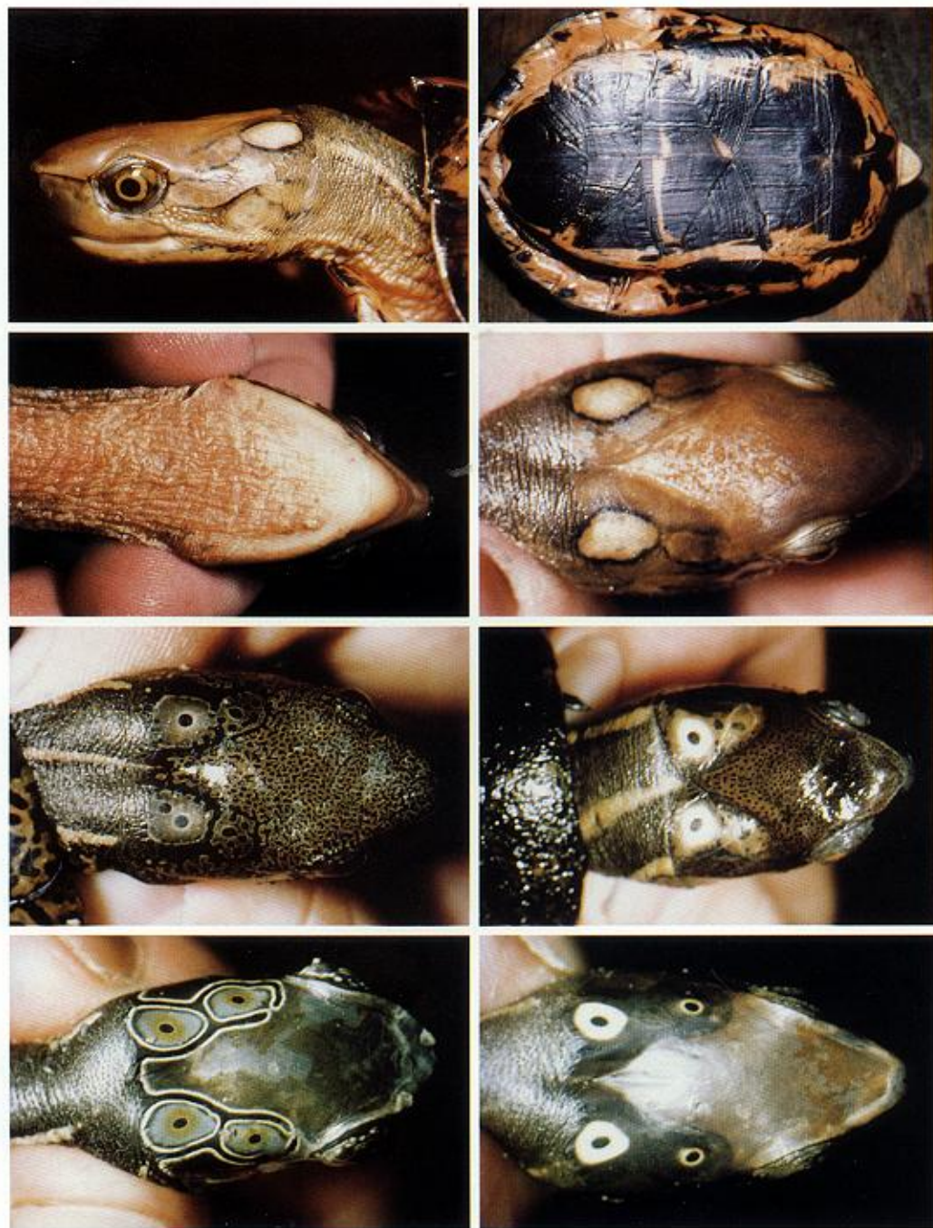
Fig. 1. Adult female Sacalia pseudocellata (A–D; paratype: UF 81506; 176 mm carapace length) from Hainan Island, China; typical head patterns of male (left) and female (right) Sacalia bealei (E, F) and S. quadriocellata (G, H).