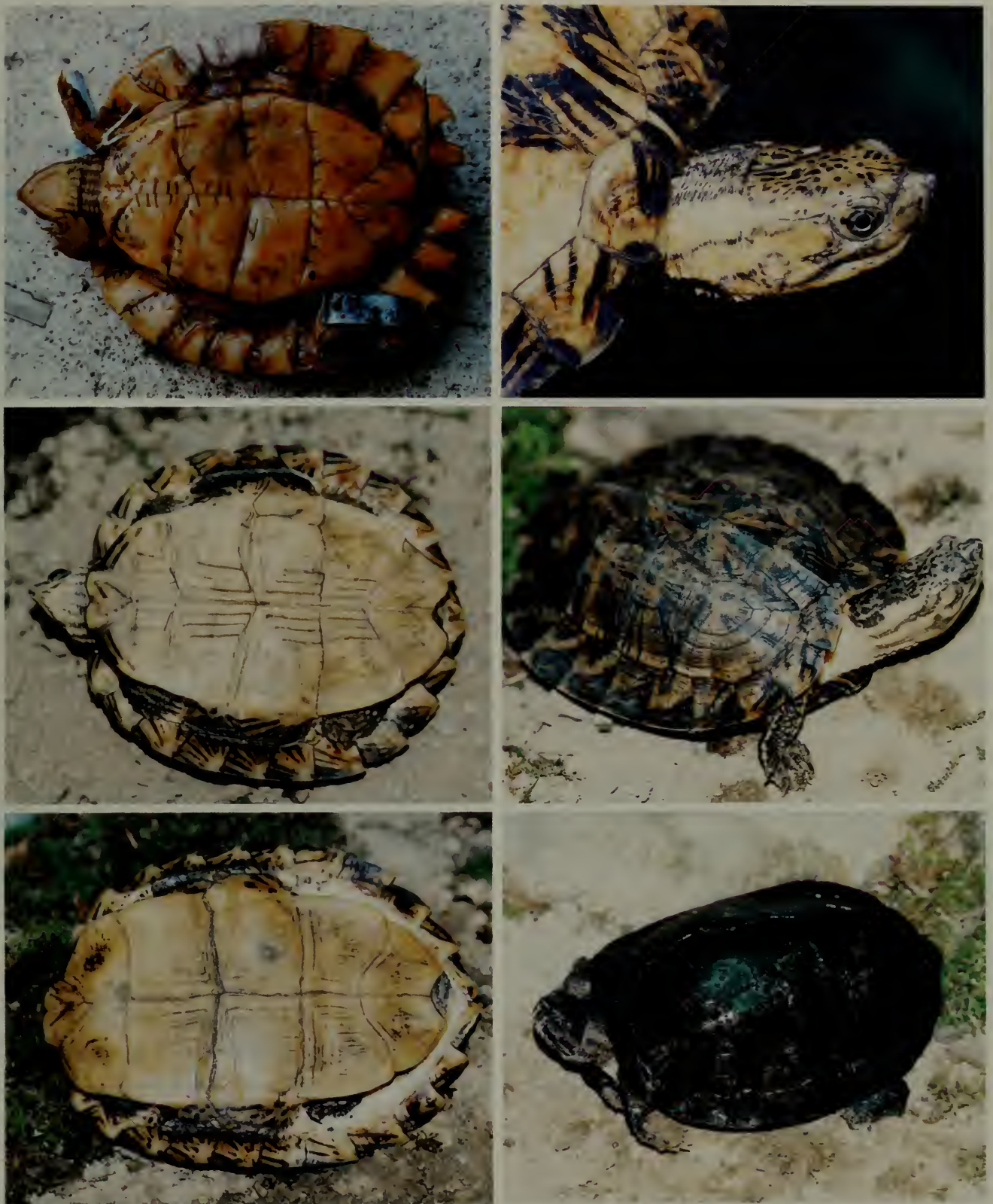
Fig. 3. Cycllemys atripons . Left (plastral views; top to bottom): carapace of first year turtle, USNM 94745, 78 mm carapace length (CL); subadult, WPM 001, 132 mm CL; adult, WPM 003, 191 mm CL. Right (top to bottom); juvenile, WPM 002, 135 mm CL; subadult, WPM 001, 132 mm CL; adult female, WPM 004, 196 mm CL.