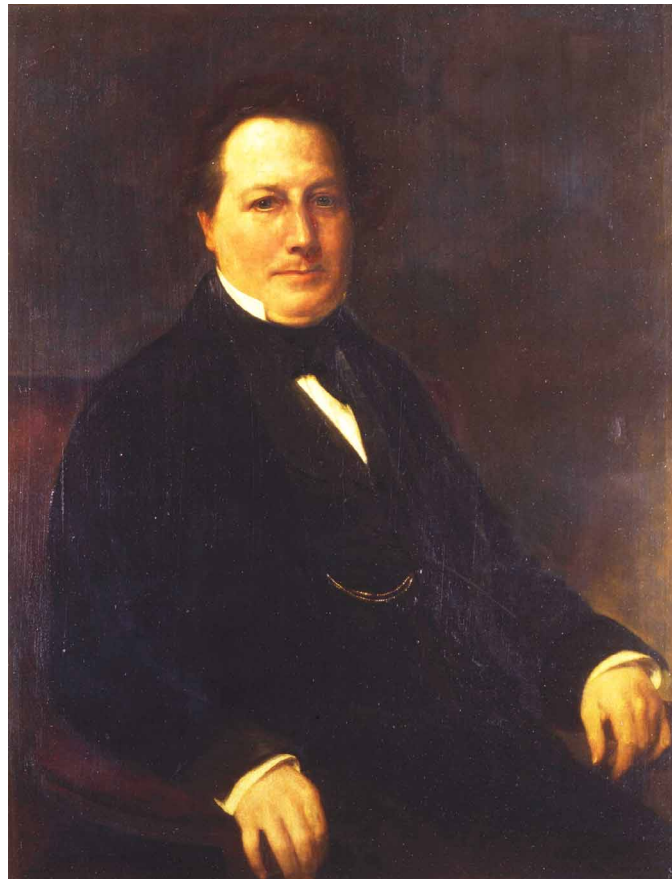
FIGURE 1. Thomas Bell (1792–1880), painted by Henry William Pickersgill (1782–1875). Portrait presented to Linnean Society, London, by subscribers, 23 rd May 1857.