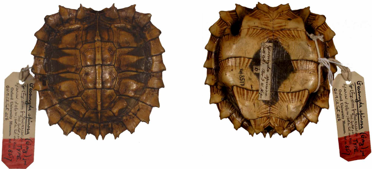
FIGURE 5. Syntype of Emys spinosa Gray, 1830 figured in the Illustrations of Indian Zoology (Gray 1830–1835), now OUM 8517.

Monograph of the Testudinata , Bell (1832–1836) placed Gray’s Emys vulgaris into the synonymy of Emys lutaria and the two depicted specimens are clearly to be identified with Mauremys leprosa . However, the taxonomic history of Emys vulgaris is rather confusing. Although traditionally regarded as a junior synonym of Emys leprosa Schweigger, 1812, this taxon was originally composed of several species (Fritz & Wischuf 1997), as evident from the figured turtles in plate 4 of Gray (1831a). To avoid nomenclatural upheaval, Fritz & Wischuf (1997) designated the figured Mauremys leprosa as lectotype, rendering the now rediscovered, surviving types from the Bell Collection to paralectotypes. OUM 8482, 8484, 8488, and 8762 are Mauremys leprosa , OUM 8483, 8485, and 8487 are M. rivulata , and OUM 8486 is a M. mutica . According to Gray (1831a: p. 24), further paralectotypes are in the Natural History Museum, London, and the Nationaal Natuurhistorisch Museum Naturalis in Leiden (formerly Rijksmuseum van Natuurlijke Historie; see also Hoogmoed et al. 2010). Gray ( loc. cit. ) mentions, moreover, that he has seen “more than twenty living” of his Emys vulgaris .