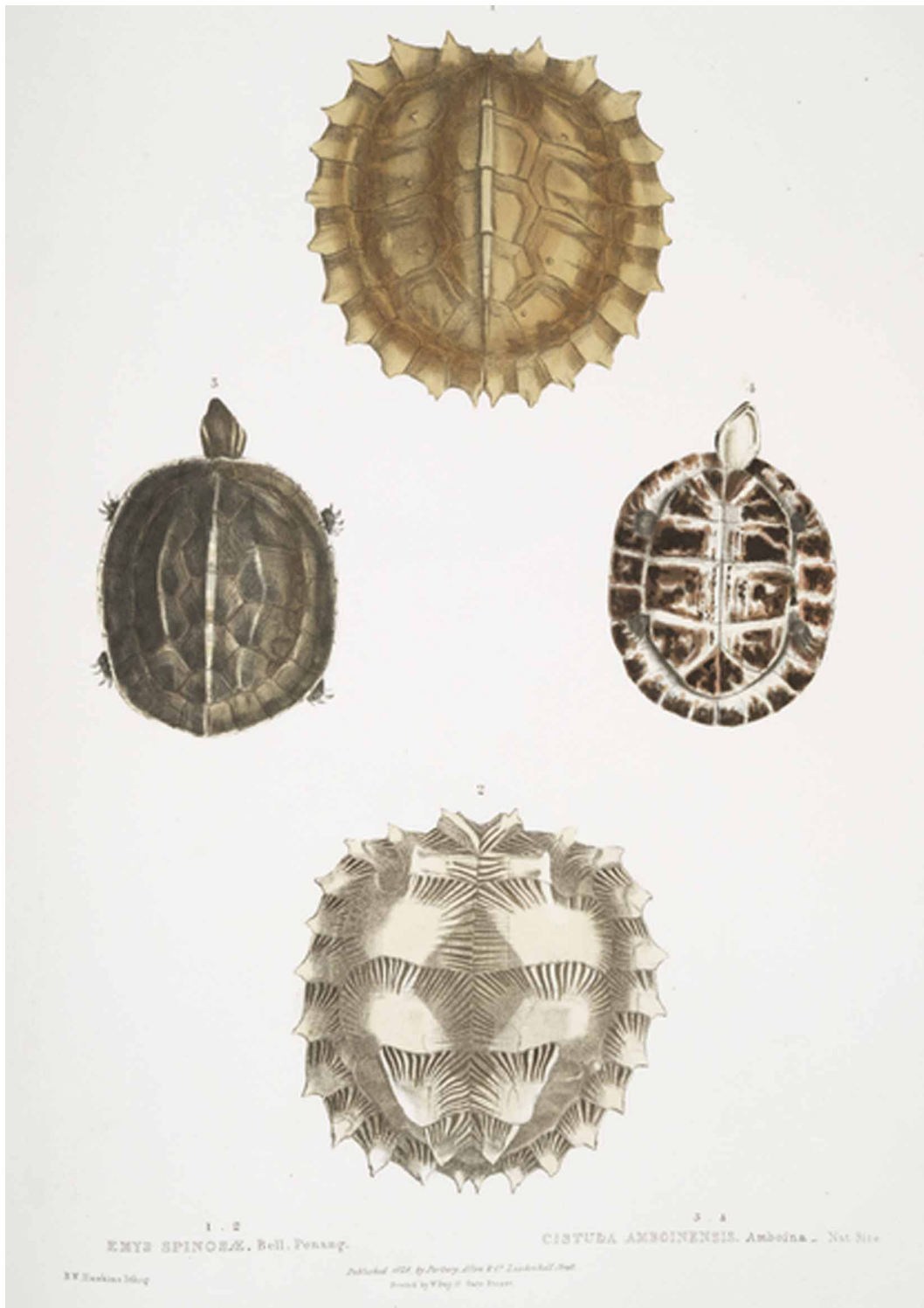
FIGURE 4. Reproduction of plate 77 from Gray’s (1830) Illustrations of Indian Zoology , showing ‘ Emys spinosae ’ together with ‘ Cistuda amboinensis ’. The name Emys spinosae is credited to Bell.

small label with number “140”); OUM 8487 (Bell Collection, Catalogue of Testudinata No. 31f; shell, SCL 7.9 cm, bears small label with number “136”); OUM 8488 (Bell Collection, Catalogue of Testudinata No. 31g; shell, SCL 7.8 cm); OUM 8762 (Bell Collection; whole, young specimen in spirit, SCL 5 cm).