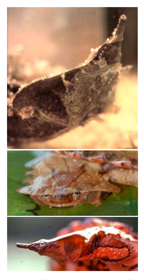
Figure 4. Heads of Chelus fimbriata.