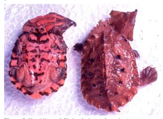
Figure 3. Hatchlings of Chelus fimbriata from the Amazon population (note stripes under neck and plastral markings.

Other scientific names that have been proposed for the matamata (listed by Pritchard and Trebbau 1984, and Fritz and Havas 2006) are based upon misspellings or casual recombinant forms. Merrem (1820) used Matamata as a generic name.