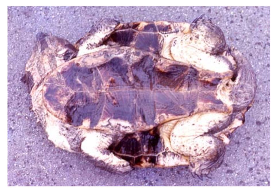
Figure 2. Chelus fimbriata from Leticia, Colombia.

both German and Latin, utilized the forms Chelus (in Latin) and Chelys (in the German text), and confusion over which spelling should be considered valid prevailed for a long time, with the Chelys defenders generally prevailing until Zug (1977) finally re-examined and analyzed Duméril's original text.