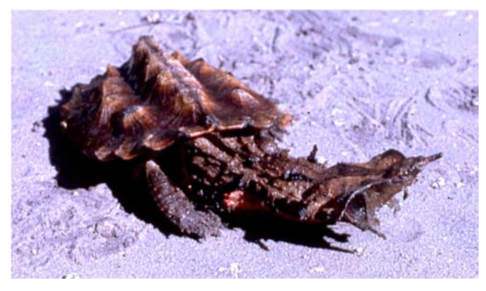
Figure 1. Chelus fimbriata from the Amazon basin in South America.

subsequently invalidated by Opinion 660 of the ICZN (International Commission on Zoological Nomenclature 1963). The same opinion established Testudo fimbriata Schneider 1783, as the valid name, an epithet that pre-dated the alternative names Testudo matamata Bruguière 1792 and Testudo bispinosa Daudin 1801. The species was transferred to the new genus Chelus by Duméril (1806). This publication, in